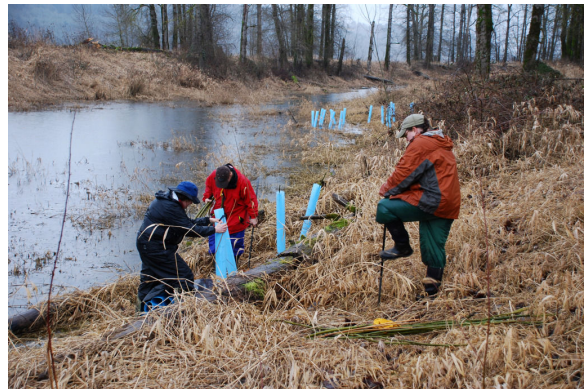
Volunteers, here planting willows, are out working on the refuge every Saturday and Sunday from January through March.

For more information, go to our website at www.RefugeStewards.org and click on calendar. Then you can click on a particular work party date for more details.