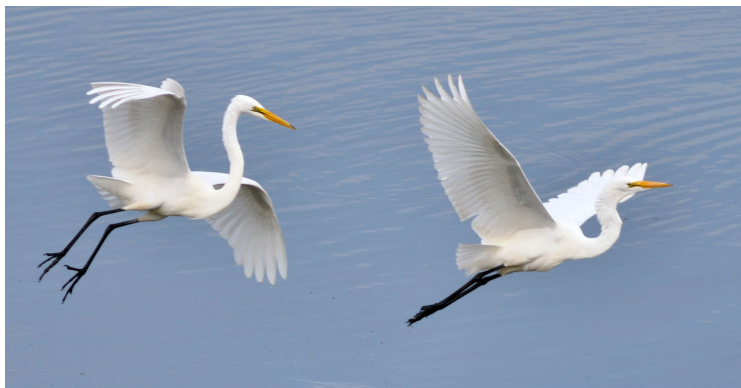
Great egrets