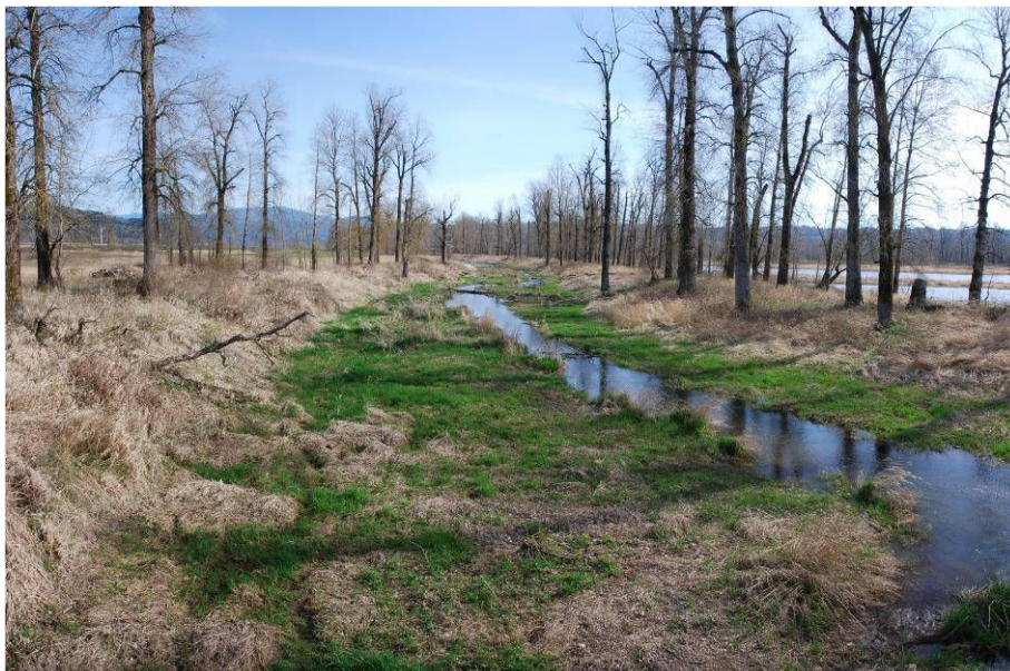
Gibbons Creek, March 2010.

Columbia Gorge Refuge Stewards PO Box 827 Washougal, WA 98671