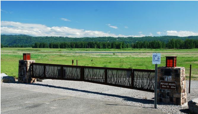
The gate to the new Gibbons Creek Wildlife Trail on Steigerwald Lake NWR